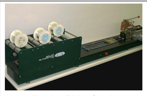
Motorized Ribbon Spools

We use motors to unwind the ribbon spools, but we allow the operator to manually move the ribbon tips to their accurate location stops. Ribbon lengths are determined by machine setup, so that manual operation always produces predictable precision.