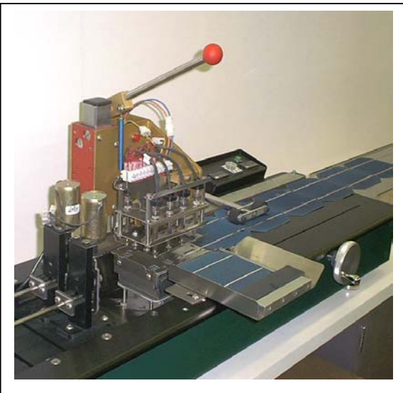
Solar Automation Combined Tabber/Stringer Model CTS20

Stringer is a radical new approach to producing strings of solar cells. It has been conventional wisdom that production efficiency increases with automation complexity. Solar Automation has created a onestep tabber/stringer that proves a small enterprise need not spend half a million dollars to efficiently solder solar cells. Semi-automatic and low-cost, this equipment is capable of producing machineaccurate strings at the rate of about 15 seconds per cell. The cost is less than one-tenth the capital cost of full automation.